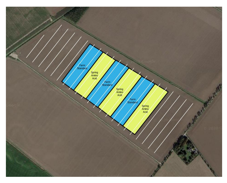
Figure 1. Example layout of amino acid tramline trial in 2018.

Each farmer set up a tramline trial designed after discussions with the ADAS facilitator (Fig. 1). The trial design was considered carefully to ensure practicality for the farmer applying the treatments and harvesting the area, but also to ensure that reliable results were obtained. This included selecting fields which would reduce the risk of treatments being compromised by underlying soil variation, and where possible, trying to replicate some treatments, and randomizing the position of treatments within the field.