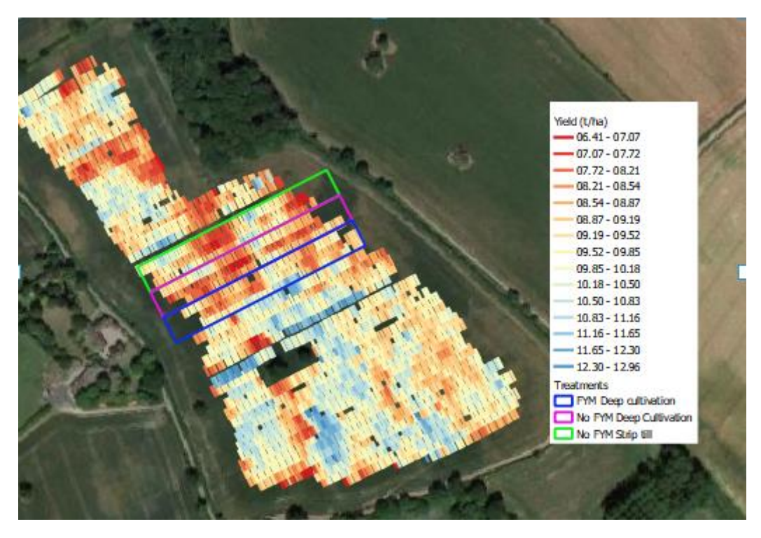
Fig. 4. Yield map of one study site showing treatment effects on yield compared to strip tillage with FYM addition (farm standard). Treatments: deep cultivation with FYM addition (blue outline); strip tillage with no FYM (green outline); deep cultivation with no FYM (pink outline).

Crop growth and yield data were only available from two of the farms. At one site the statistical model indicated that there was no significant difference in yields, with the shallow cultivation treatment (the farm standard) yielding on average 11.57 t/ha and the minimum tillage and deep cultivation treatments 0.44 t/ha \pm 0.71 and 0.77 t/ha \pm 0.84 less, respectively. At the other site the strip tillage with FYM addition (farm standard) yielded on average 9.70 t/ha and significant yield reductions were seen in all three trial treatments; deep cultivation with FYM addition -0.28 t/ha \pm 0.20; strip tillage with no FYM – 0.49 t/ha \pm 0.21; deep cultivation with no FYM – 0.70 t/ha \pm 0.21.